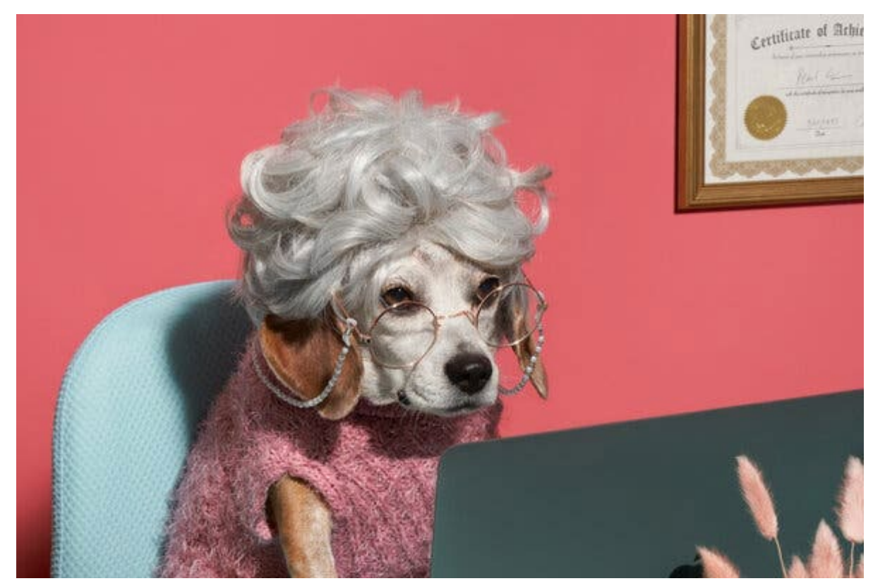
I Don't Want to Be the Office Grandma 4h ago