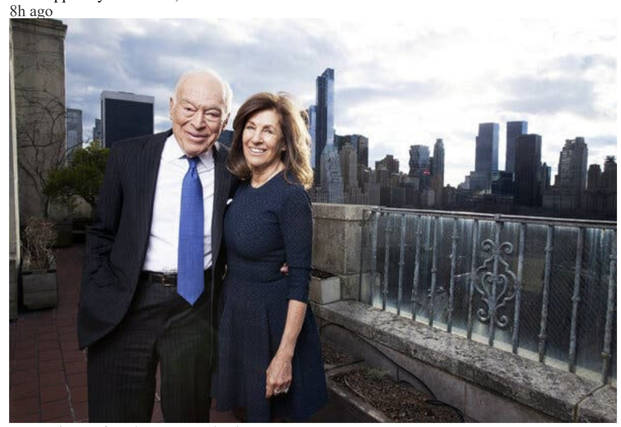
Why This Billionaire Will Never Leave New York Nov. 26